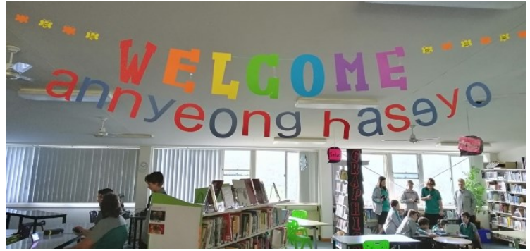
The "Welcome" sign in the Library in English and Korean.