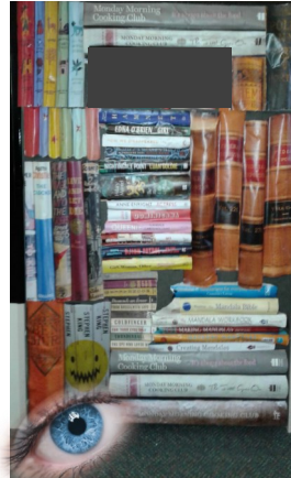
The Library's book return is getting a makeover. Keep an eye out for the finished product!